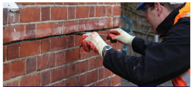
HeliBar is inserted into HeliBond grout with a cut slot